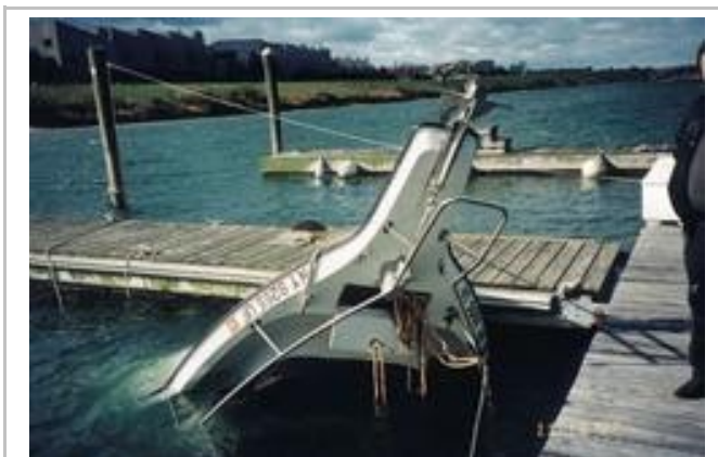
Most boats sink at the dock, like this center console that went under due to a failed hose clamp.

Editor's Note: If you're a boat owner, you know there is nothing more frightening than the idea of finding your boat sticking out of the water instead of riding atop it. Today, BoatUS offers ten reasons why boats sink.