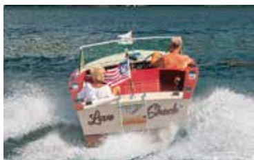
Non Wood Inboard/I/O: David Wesp Love Shack