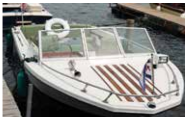
Late Classic: Gerry Morse Papa's Toy