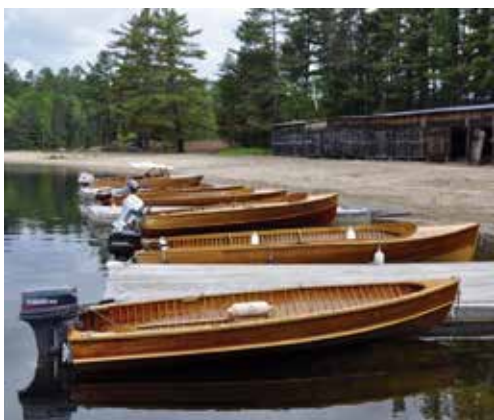
A collection of classic Peterboroughs.