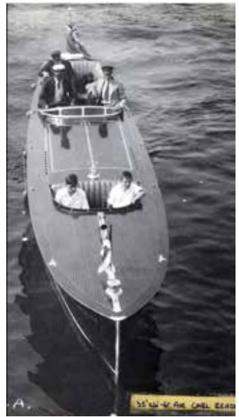
A Custom 35' Ditchburn.