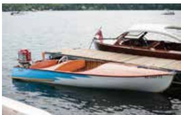
Outboard Boat and Motor with Steering: Toby Hall, Zeke