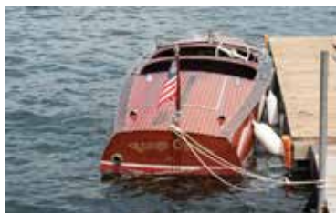
Chris Craft: Joe Oliver Bongo Cruiser